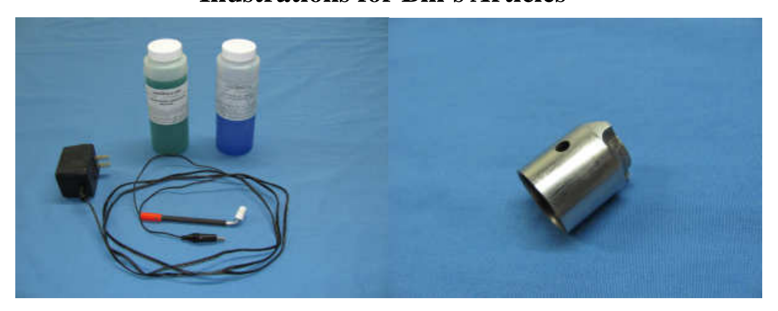
Plating Kit Nickel Plated Bantam Piston