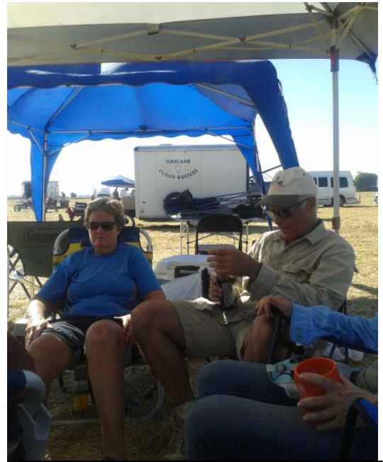
Staying cool under the misters