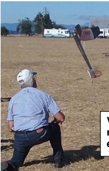
VTO (as if it needed any explanation!)