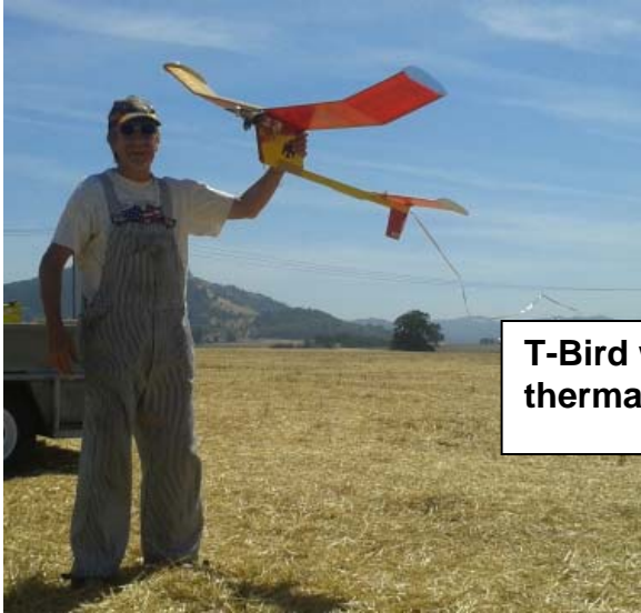
T-Bird with thermal streamer!