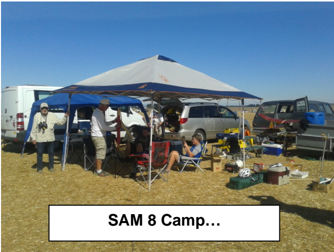
SAM 8 Camp...