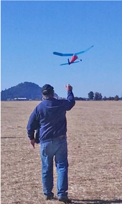
Up, up and awaaaay.... (see page 7!)