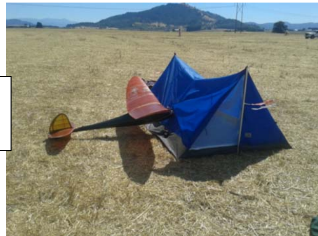
Pup Tent Airplane Catcher