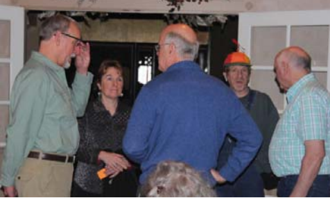
Pre Banguet chatter