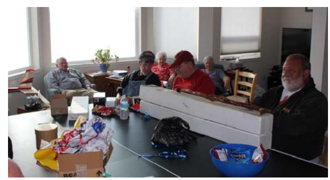
Auction results, with Greg T. looking smug!