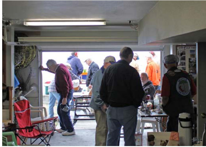
The view from within....to the sea! ...and the sea of activity!

Great weather, great group, great food (see Prez's report above!) and pics below! !