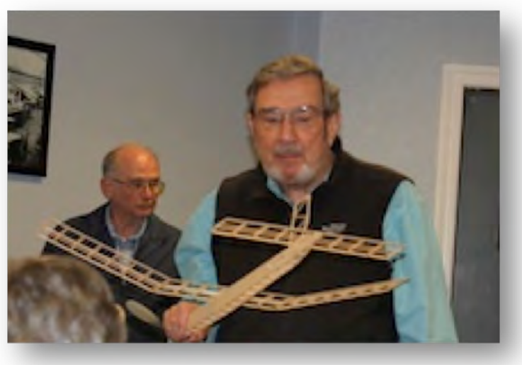
Tom's nice looking P-30 Square Eagle bones