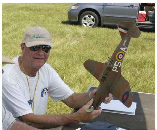
Judging FAC Scale