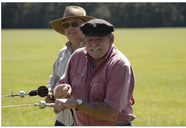
Smile for the Camera