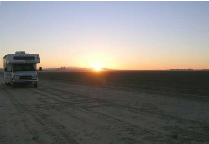
Sunrise at Eloy Arizona, Cold and Clear