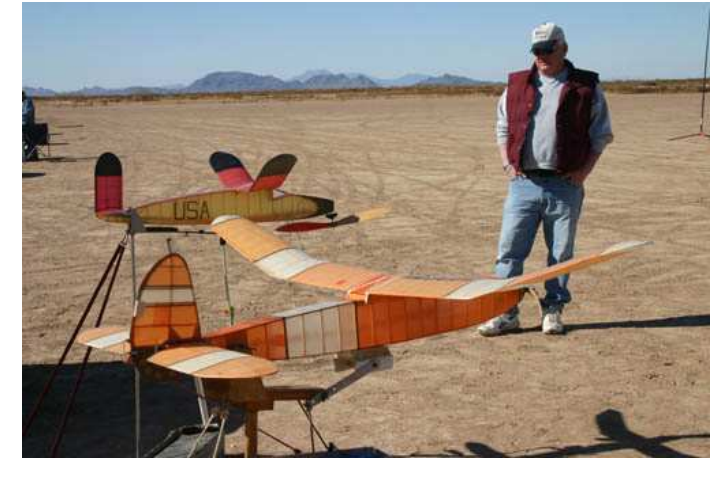
Lamb Climber, Front, Lanzo Classic Rear