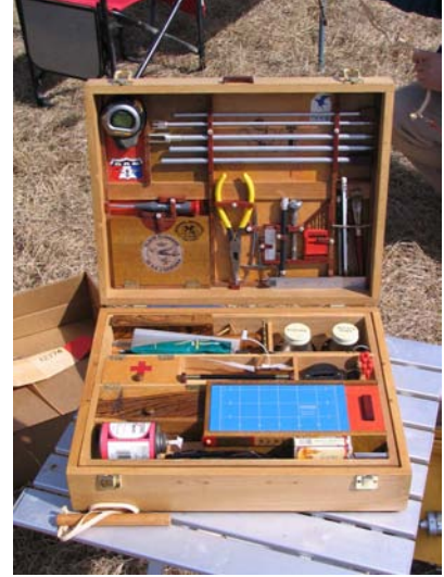
Doug's Box #2