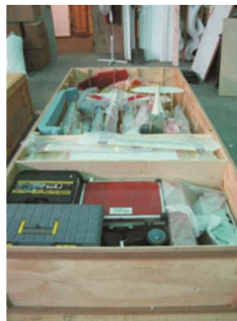
Crates full of models for our first Canowindra challenge

The champs are held over four days they started with vintage f/f and allowed the dixer to fly as it was the 50th anniversary of the model, I had one that was already trimmed, unfortunately for Troy we hadn't trimmed his and this ended in disaster when we spread it all over the paddock on its first flight, I ended up in second place so all was not lost.