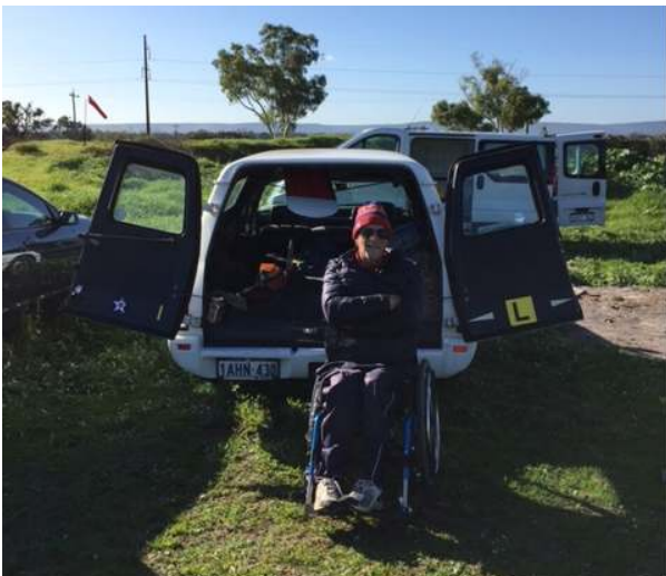
Baarty feels the cold at Antique 38..