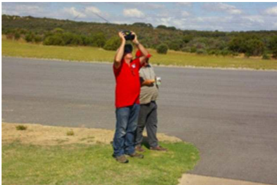
And forty years later we haven't changed a bit.