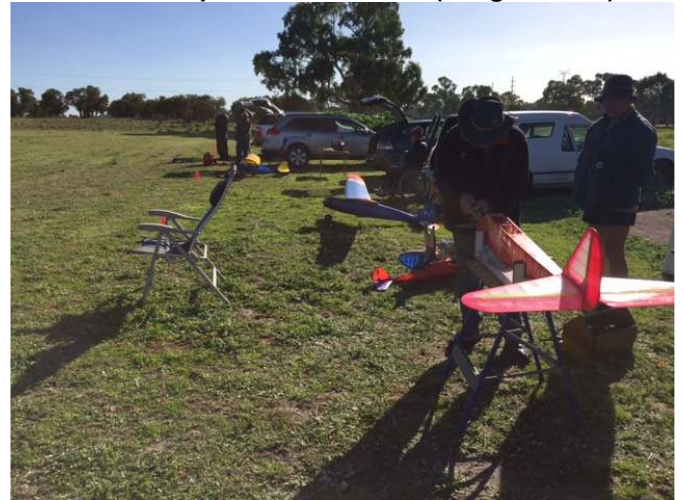
Antique 38 lineup – lovely weather for once!

NOSTALGIA was held on 19 th June and the weather dawned windy and cloudy. Five intrepid (foolish) pilots decided to give it a go and it was soon discovered that a low level jet-stream had established itself over the flying field. This meant that no matter how high you went the only way to get back to the field was to dive at high speed to low levels subsequently there were no maxes recorded.