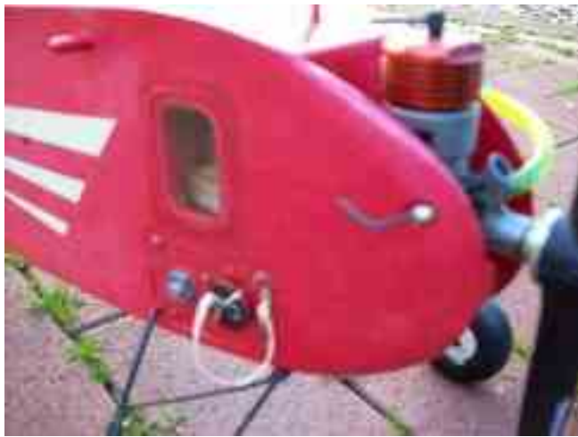
View showing the shorting plug where a current meter would be inserted.