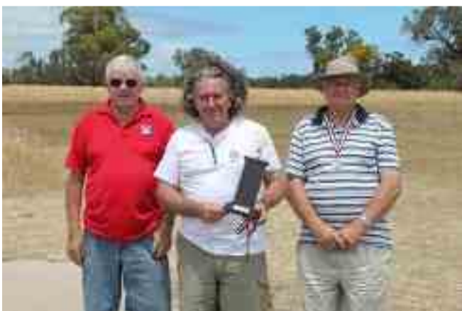
.. and the also happy Tomboy electric winners