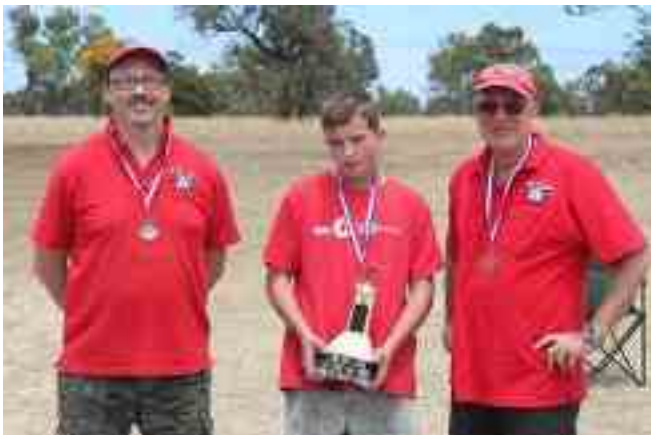
The happy IC Tomboy winners