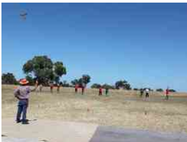
The mass launch produced some "interesting" moments as models competed for airspace.

Sunday the 9th saw the AWA state 1/2A Texaco event get underway with 8 starters. It was a little windy but there was plenty of good lift to be found. In round 3 most made the 10min max with only a 30 second engine run.