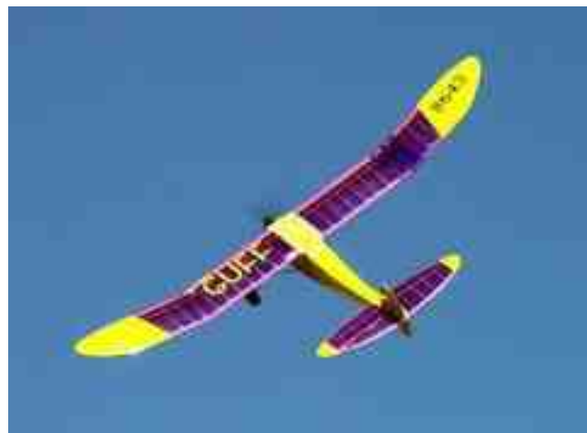
The "Guff" shows off its hi-vis colour scheme