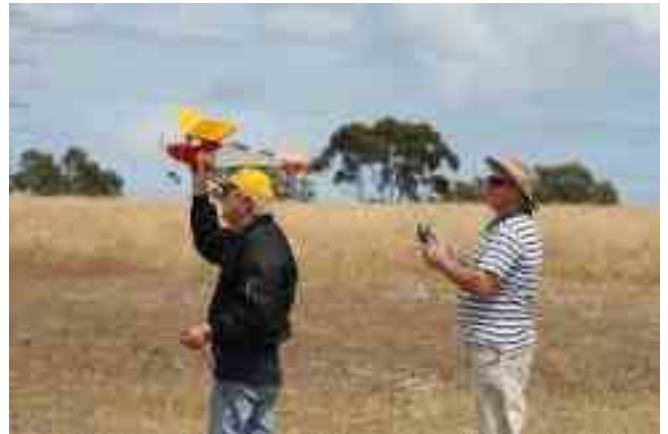
Les launching Ray's electric powered Tomboy