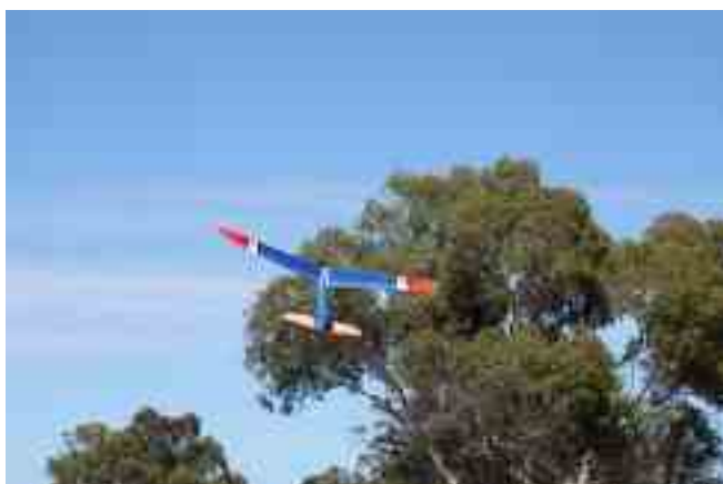
Dickos 1936 Texaco winner powered by an Anderson spitfire. The tree looks closer than it actually was.