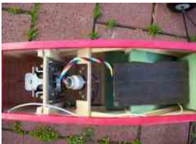
From left to right: Relay, Rx plug panel and Receiver.