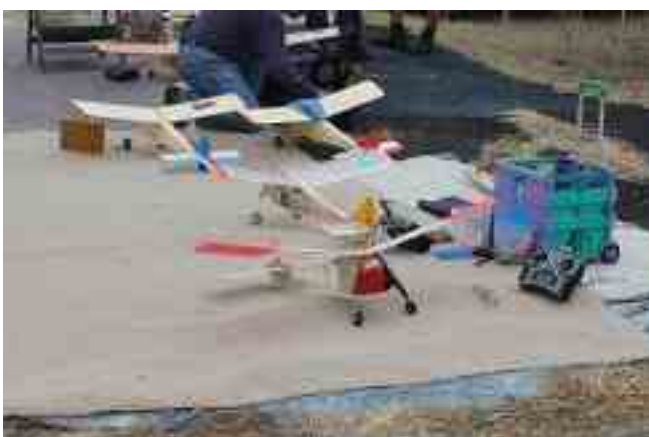
Tomboy's enjoying the new carpet in the pits.