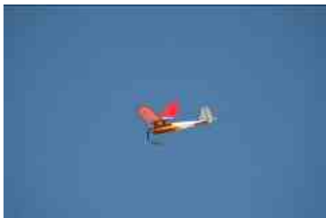
This 1/2a Bomber was obviously enjoying the hot conditions