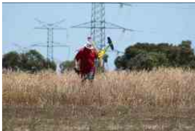
Rod takes a pleasant stroll through the paddock, watching out for snakes