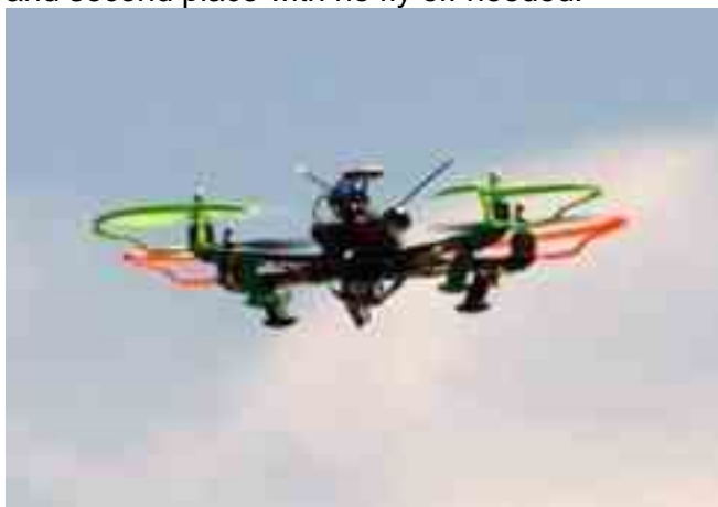
A "Visitor" watches the event from behind the pits.

The AWA State 38 Antique was run on the 16 th of November at our field in Oakford. This event attracted 7 starters in pretty good weather conditions. No one managed 3 maxes but it was close with the top 3 managing 2 maxes + a near max. Only 15 seconds difference between 1st and second place with no fly off needed.