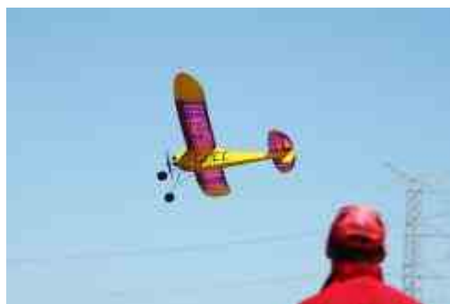
Troy brings the "Guff" into the landing zone.