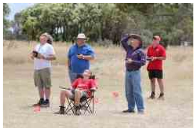
All eyes skywards as the competition heats up