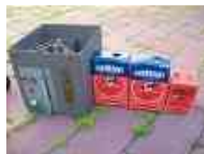
Front view of HMV ground based Transmitter. All these batteries were needed to power the Tx. Comprising x2 45V and one 3V – these would have been quite costly to replace back then and they were also non-rechargeable!