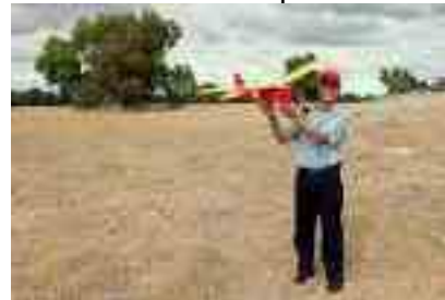
The "Sparky" gets an airing at Oakford, but still awaits its maiden flight away from any 27Mhz interference.

Lately, I have managed to buy an original Allbon Javelin and a transplant looks very likely!