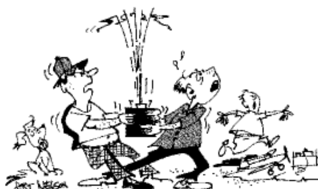
"I think its time we looked at using a buddy box Charlie!!"