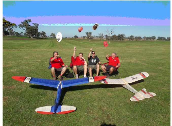
Team 270 Celebrate a great SAM Champs campaign on the flightline at Antique 38.