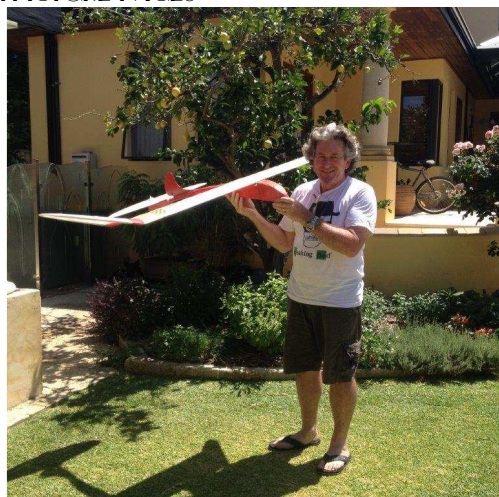
Dicko and his Snoak pose for "Australia's next top Model" (Get it?)