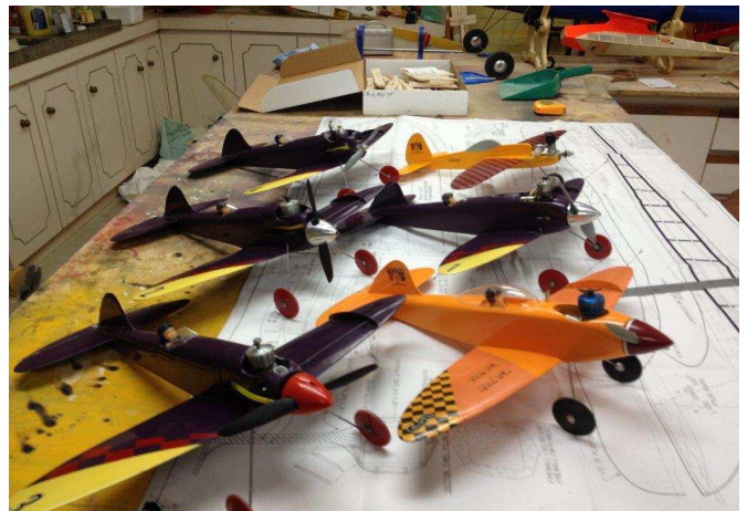
The Phantom Fleet – 4 Mk1's, a Mk2 and a Champ.