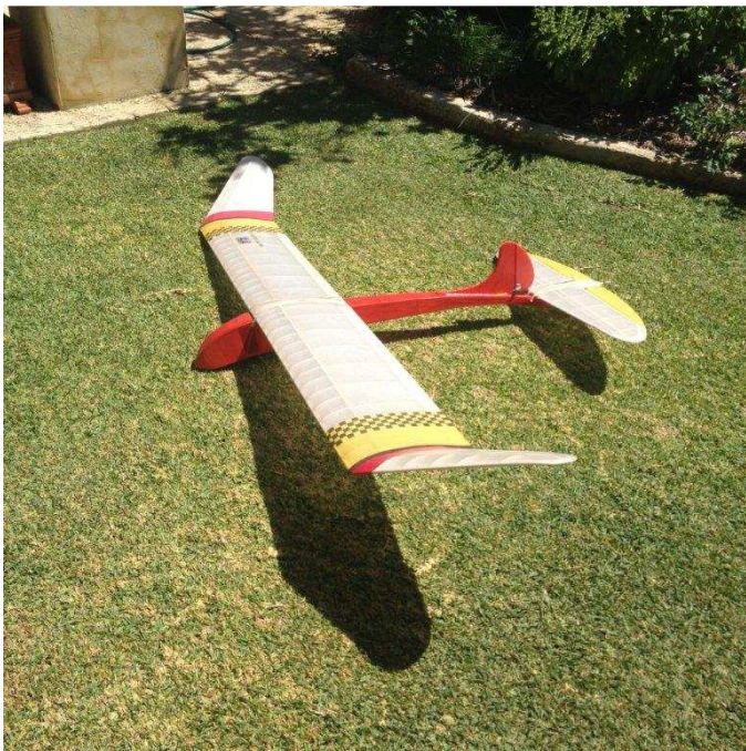
Snoak Vintage Glider - Scaled to 120%. Covered in Silk and Polly span with tissue trim. Design by Dick Twomey