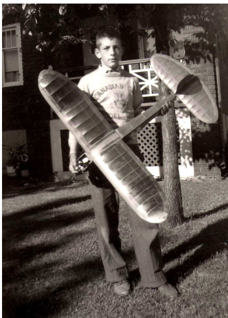
1946 my 1st gas model 'Soarhead' from June 1943 Flying Aces ,one of the 1st Ohlsson 23 to come to Canada after WW2.

Its great to know that our activities are well known and indeed eagerly anticipated! While The Geezer was created for our SAM270 folks, the viral nature of the net has extended our reach beyond the borders of Australia. I just LOVE receiving content and feedback from all over the SAM Universe! Thanks Warren for the kind words and pics! More Please! I also have it on good authority that Ian has been able to oblige you with an electronic copy of the Little Diamond.I have one of these and it is a terrific soarer- ed