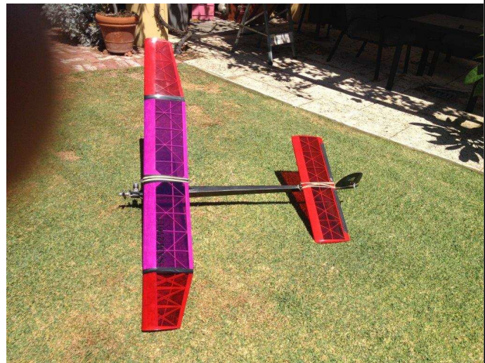
Jay's Bird from Aeromodeller 1956 57in span Built for Burford duration and powered with a series 12 ball raced diesel.