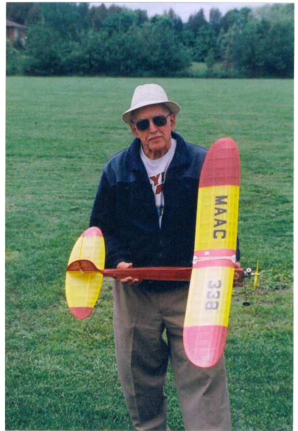
(2) current 1/2A Texaco,80% 'Alert'