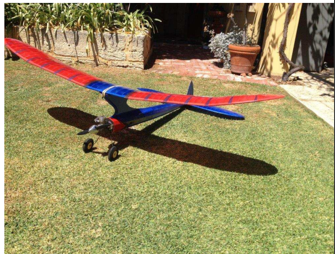
Civy Boy, 74 inch span silk covered with tissue, paint and decal trim. Powered with a KB 40 rear induction glow. Built for Nostalgia comps