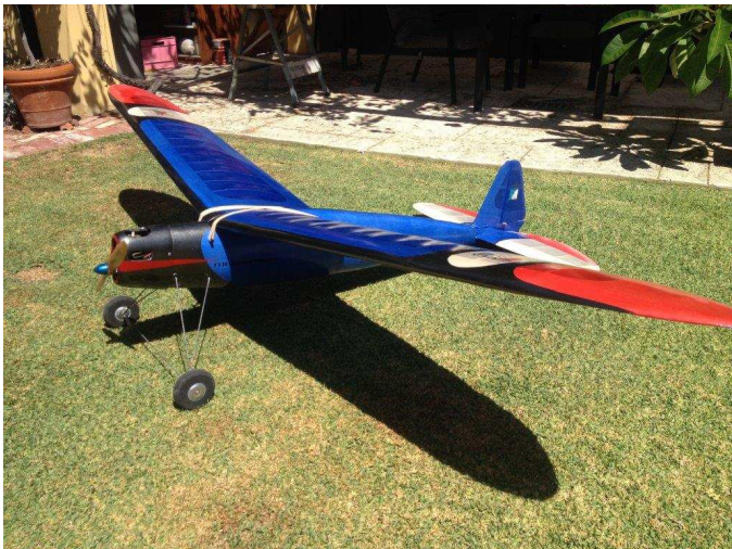
1936 Texaco Winner designed by Frank Tlush. 104 inch span covered in silk and trimmed with paint and decals.