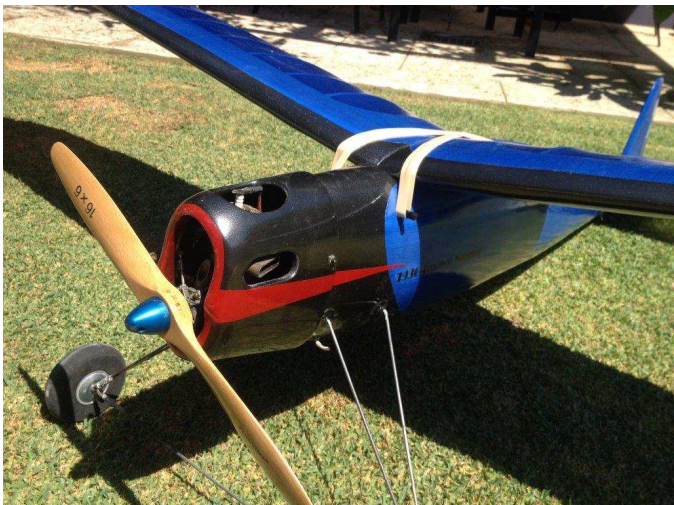
Powered by Anderson Spitfire spark.

This is but a sample of the arsenal to be unleashed upon the modelling fraternity in SAM1788! Looking forward to seeing them all in action come Easter!