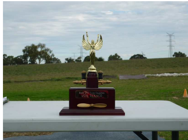
What we were playing for..

A cold, calm and overcast morning greeted the seven pilots who turned out for Half A Texaco, the first event of our double header Sunday. Early conditions proved difficult with very few maximum flights achieved. However, as the morning progressed several pilots did manage to record maximum flight times of six minutes. As no one achieved more than two maximum flights there was no need for a fly off.