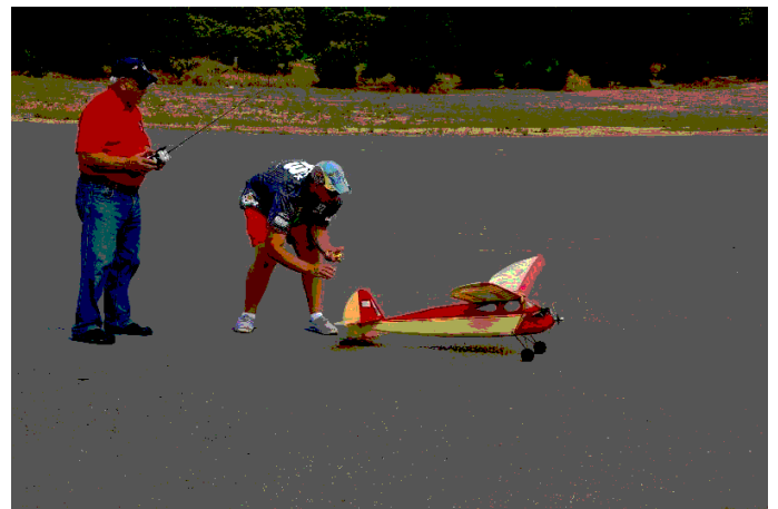
Scram!! Well – that's what is!!