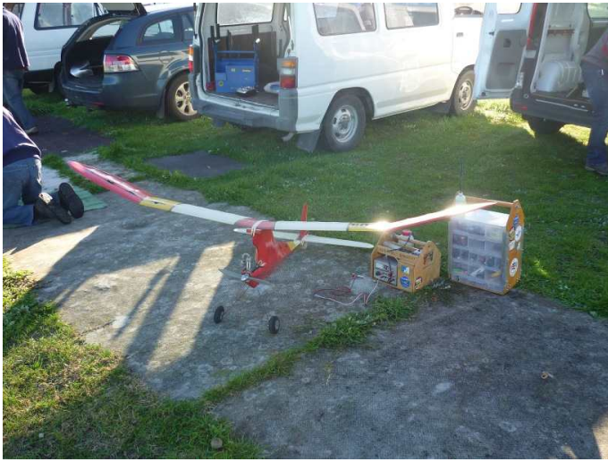
The early morning sun glints off Dicko's Stardust Special

Cool clear conditions welcomed the seven pilots who came down to the flying field to compete in this years club Duration event. Early flights showed that it was possible to achieve the maximum flight of seven minutes and most competitors managed at least one during the day. Two pilots managed to record three maximum flights and a fly off was required to decide first and second placings.