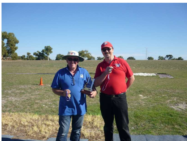
Bless 'em all, bless 'em all..the fat and the short and the tall..

Overall it was a good start to the competition year. As always a big thank you must go out to all the competitors and the other kind folk who came down to generally help out.