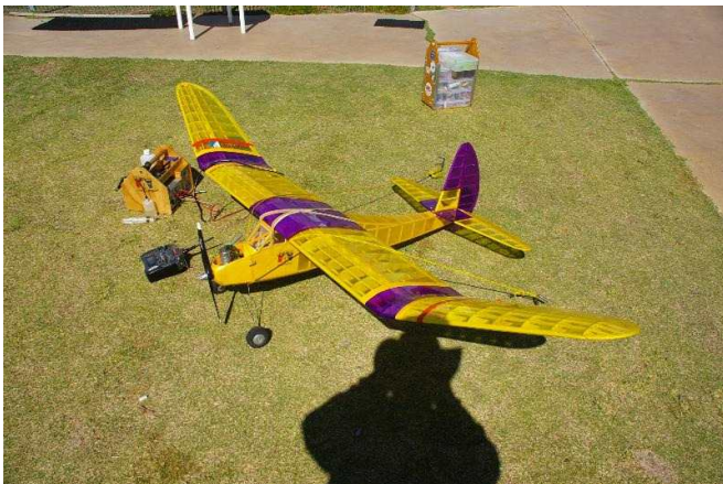
Dicko's Airborn captured landborn..

The afternoon of day three saw a slight change of weather with the breeze freshening from the west and the air temperature dropping. Five pilots started the event with only two making it into the fly-off.