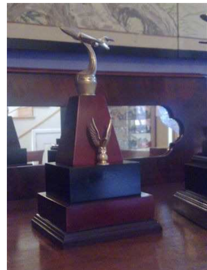
Standard Duration Trophy