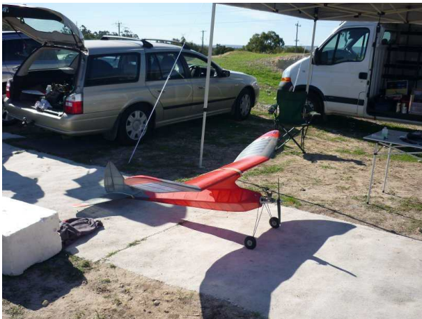
Dicko's venerable Anderson Pylon

The day was a fine Autumn Day with light cloud cover and a moderate temperature was forecast. The breeze on the other hand was fluky and there was little or no lift to help the seven competitors. The upshot of this was nobody recorded a ten minute maximum and as a result there was no need to conduct a fly-off to determine the final placings. Due mainly to the gusty conditions, four of the seven pilots had out landings.