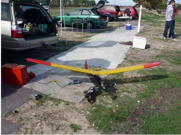
MG2 of Rod "Big Mac" McDonald

Texaco is a limited fuel event based on aircraft weight and engine type. The weigh in was completed using a set of digital scales donated to the club by Dicko. Who also generously supplied the fuel happily used by all competitors.