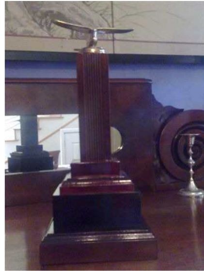
Antique 38 Trophy