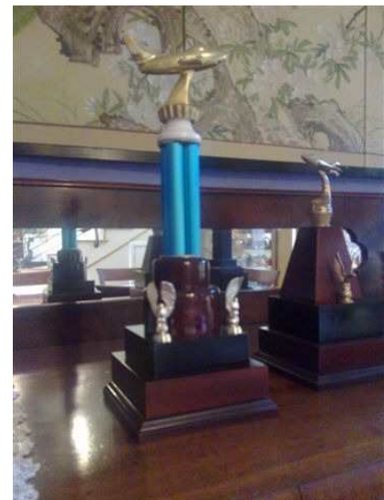
Open Duration Trophy