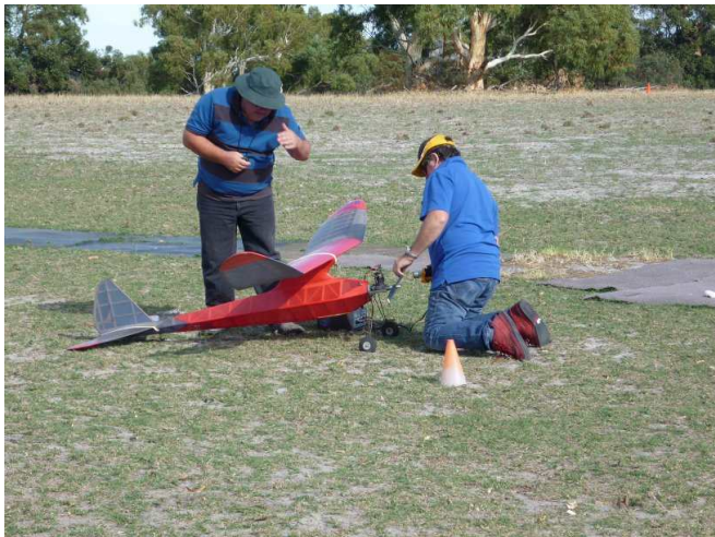
“Dicko” gets the Thumbs up from Dickens at Texaco..