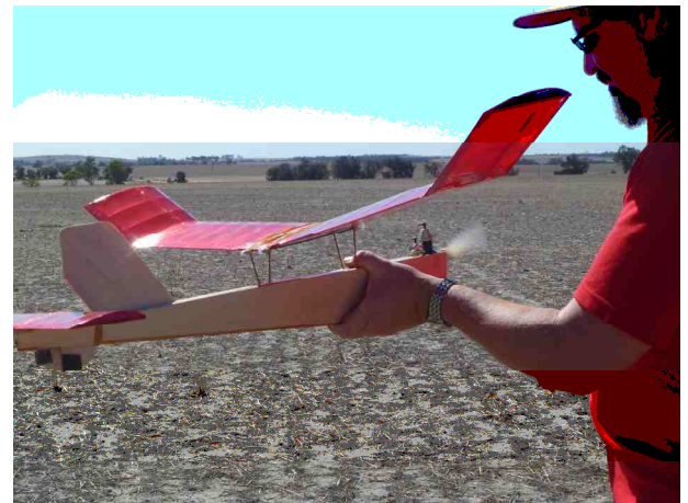
Ed's "Hatchet Man" in a rare moment of operation..

Ian Dixon rolled out his ever reliable Doonside Mills powered "Hatchet Man" scrambler which he had trimmed to perfection. The aircraft circled lazily at about 20 feet before DT'ing almost on top of a waiting Dicko. A few shouts of "HEADS!!" were required as the little Mills hauled it skyward over the pits. The Hatchet Man was designed in the 1970's and is a very simple and robust free flight model. Its available from the "Airborne" plan service.