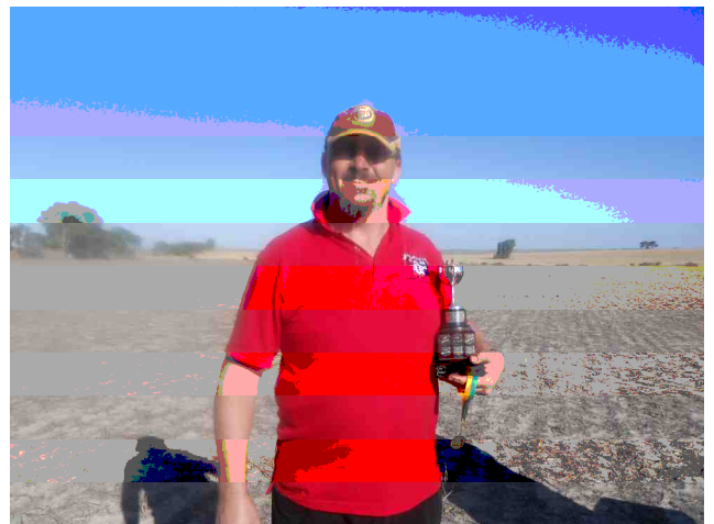
Smug fat bastard with the Chuck Glider Trophy