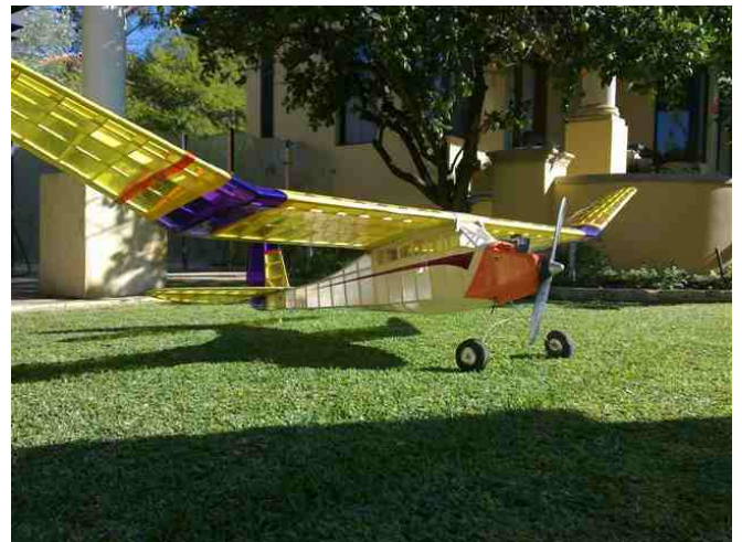
Nice view of the Krylon trimming on the cowl and starboard fuselage.