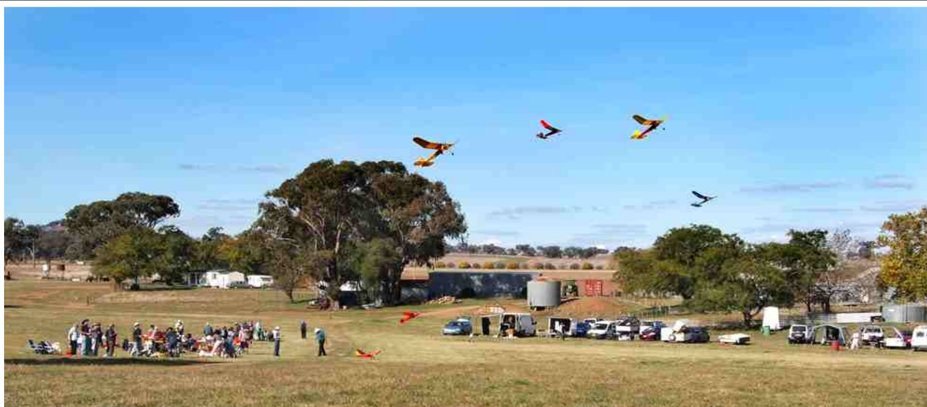
SAM Champs 2011 Texaco flyoff. Bombers Rule!!