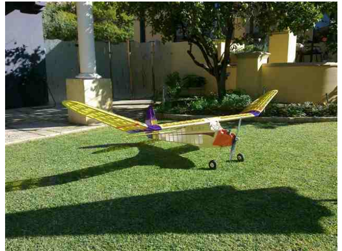
Airborne sitting on the grass in Dicko's backyard..

All up weight 4.5 pounds powered by OS open rocker 60 / 4 stroke