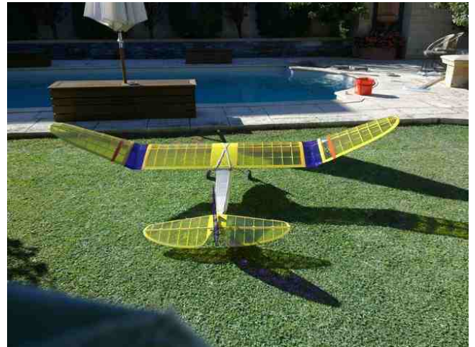
Rear View. Easy to see the distinctive Lanzo layout..