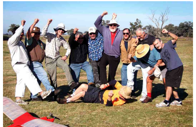
Condo gets stomped by a bunch of marauding cane toads..