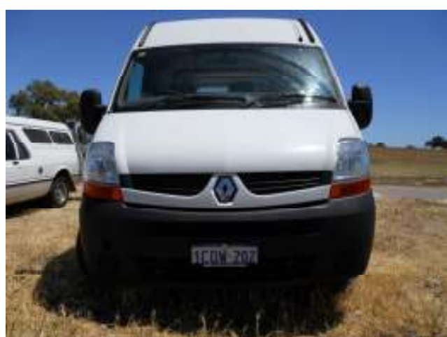
1COW may not be as dangerous as a whole herd but it can turn nasty in an instant! Hide your flight box! You have been warned..

For those of you not familiar with this 1COW, I have attached a picture. Remember: If you see this beast sitting in the pits, DO_NOT_LEAVE_ANYTHING_WITHIN_ITS_REACH!!