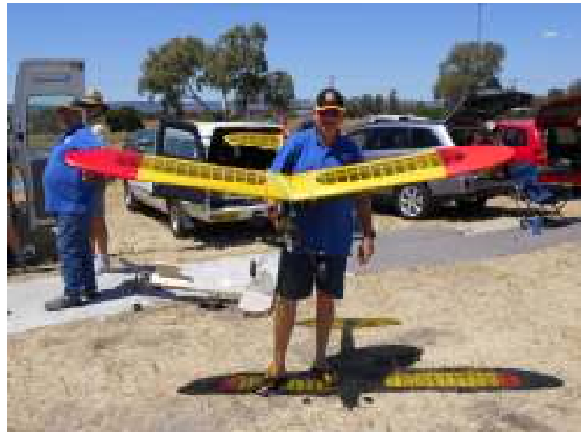
Rod "Big Mac" McDonald with the third placed MG2 – sometimes there ain't no substitute for square inches.,