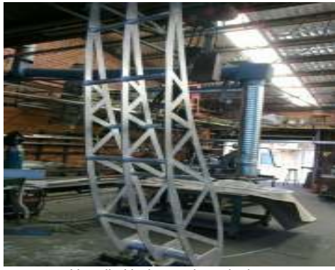
Heavily Undercambered wing..