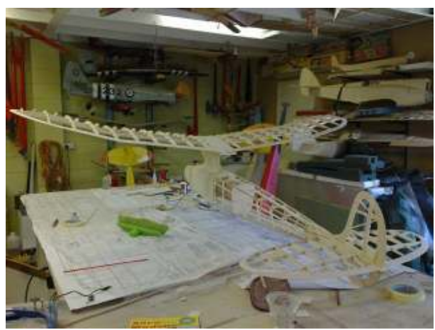
..and from this angle..