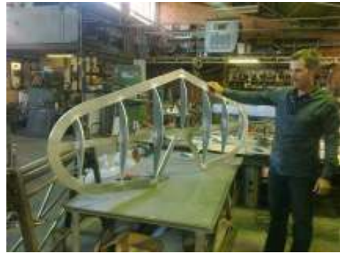
Very Lanzo -ish Tail..