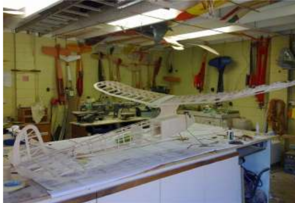
Looks good from this angle..