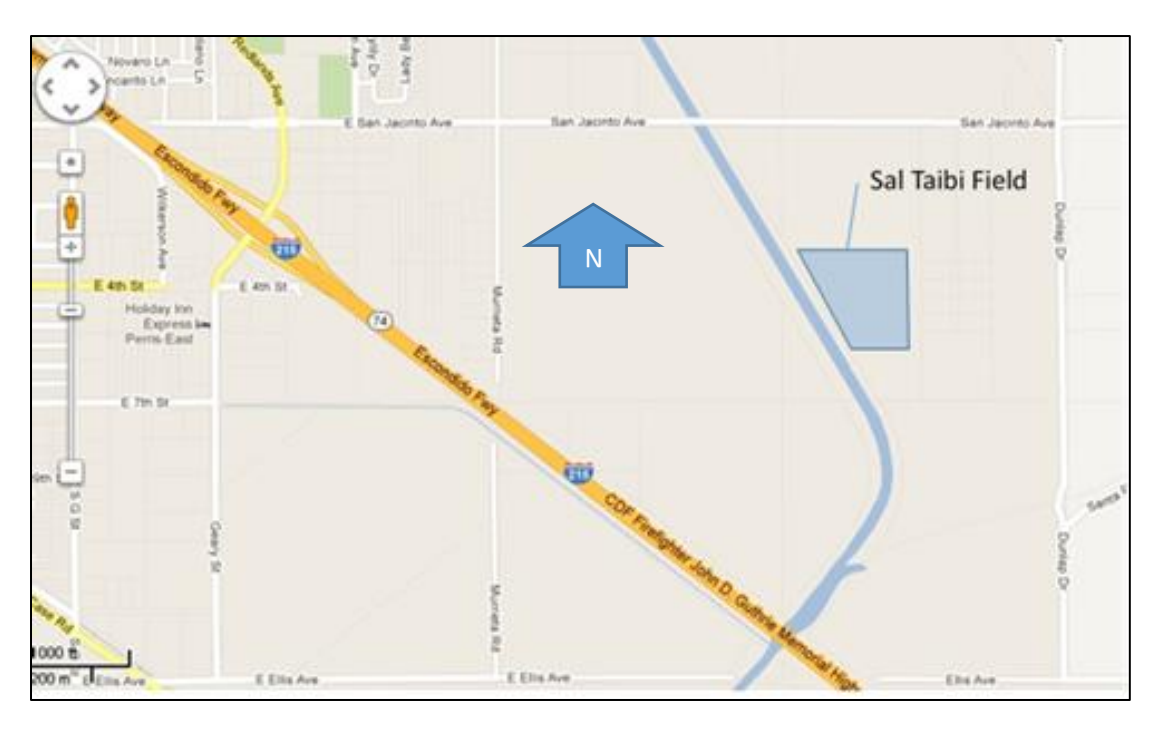
Note to guests interested in observing or flying free flight models at Perris:

The usual time to catch us in the act is in the morning. Most Saturday mornings are when people come out to test fly or tune up their models and skills, and just have a good time. You can observe the Southern California Aero Team (SCAT) FAI rubber and glider flyers along with with others flying a range of model types-mostly endurance rubber powered and electric or gas powered. Scale free flight models are flown when the San Diego Scale Staffel has their FAC contests-check their website for schedules. These are typically conducted over two day periods to get in all the event categories normally flown. Flying usually starts 7-ish and ends late morning depending on winds. There is a larger group that flies on Wednesday as well if you would rather make a mid-week trip.