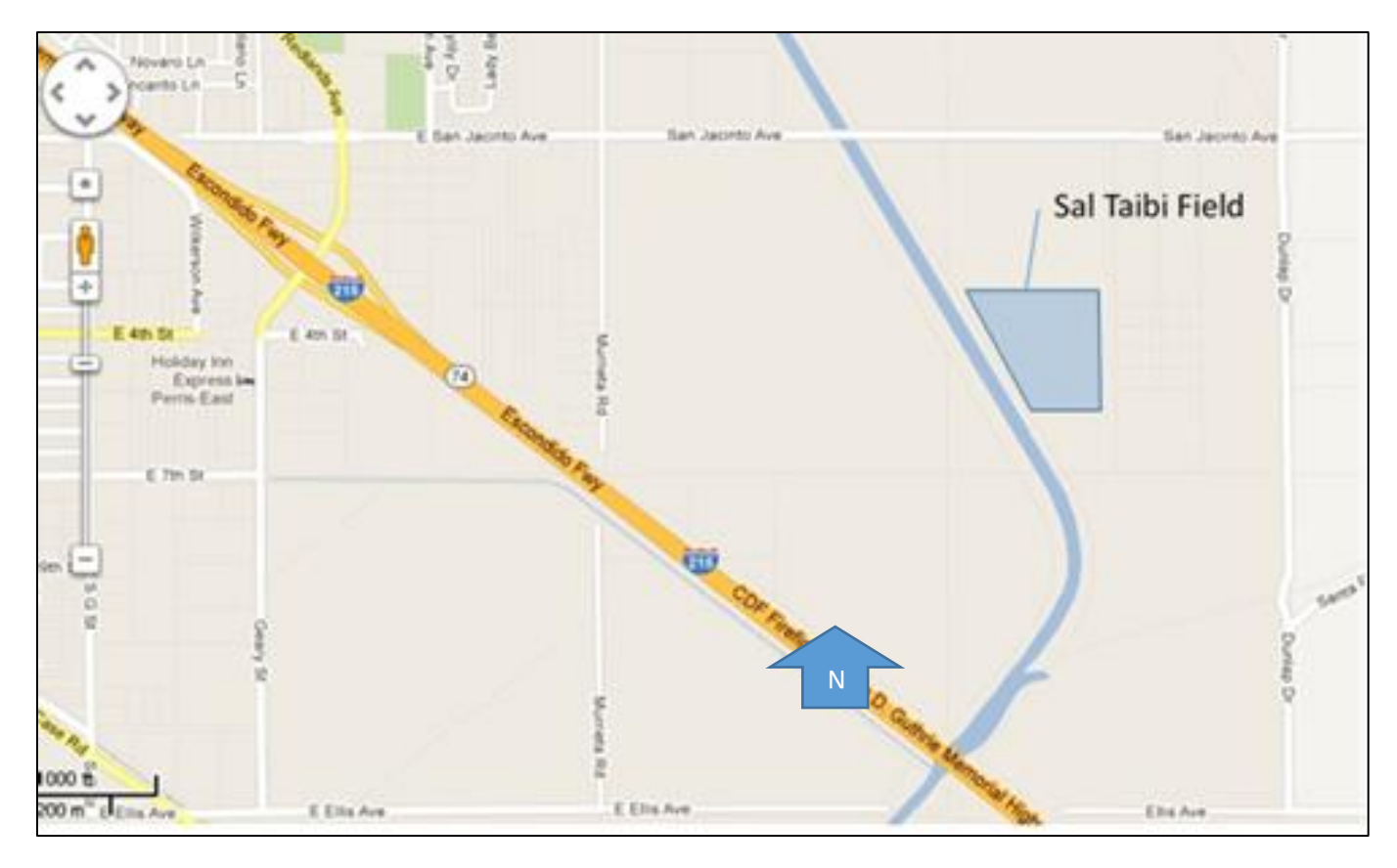
Note to guests interested in observing or flying free flight models at Perris:

The usual time to catch us in the act is in the morning. Most Saturday mornings are when people come out to test fly or tune up their models and skills, and just have a good time. You can observe the Southern California Aero Team (SCAT) FAI rubber and glider flyers along with with others flying a range of model types-mostly endurance rubber powered and electric or gas powered. Scale free flight models are flown when the Scale Staffel has their FAC contests also noted above. These are typically conducted over two day periods to get in all the event categories normally flown. Flying usually starts 7-ish and ends late morning depending on winds. There is a larger group that flies on Wednesday as well if you would rather make a mid-week trip. Come join us-see the map above for an idea on directions-it's on the east side of the 215 freeway, off San Jacinto Ave.-there is a dirt road entrance on the right.