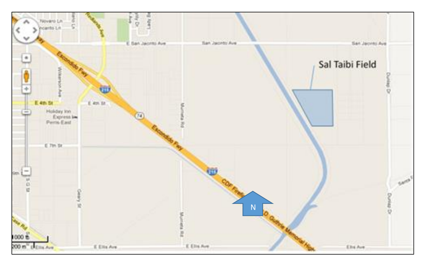
Note to guests interested in observing or flying free flight models at Perris:

The usual time to catch us in the act is in the morning. Most Saturday mornings are when people come out to test fly or tune up their models and skills, and just have a good time. You can observe a handful of top FAI rubber and glider flyers along with with others flying a range of model typesmostly endurance rubber powered and electric or gas powered. Scale free flight models are flown when the Scale Staffel has their FAC contests also noted above. These are typically conducted over two day periods to get in all the event categories normally flown. Flying usually starts 7-ish and ends late morning depending on winds. There is a larger group that flies on Wednesday as well if you would rather make a mid-week trip. Come join us-see the map above for an idea on directions-it's on the east side of the 215 freeway, off San Jacinto Ave.-there is a dirt road entrance on the right.