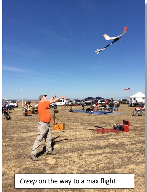
Creep on the way to a max flight