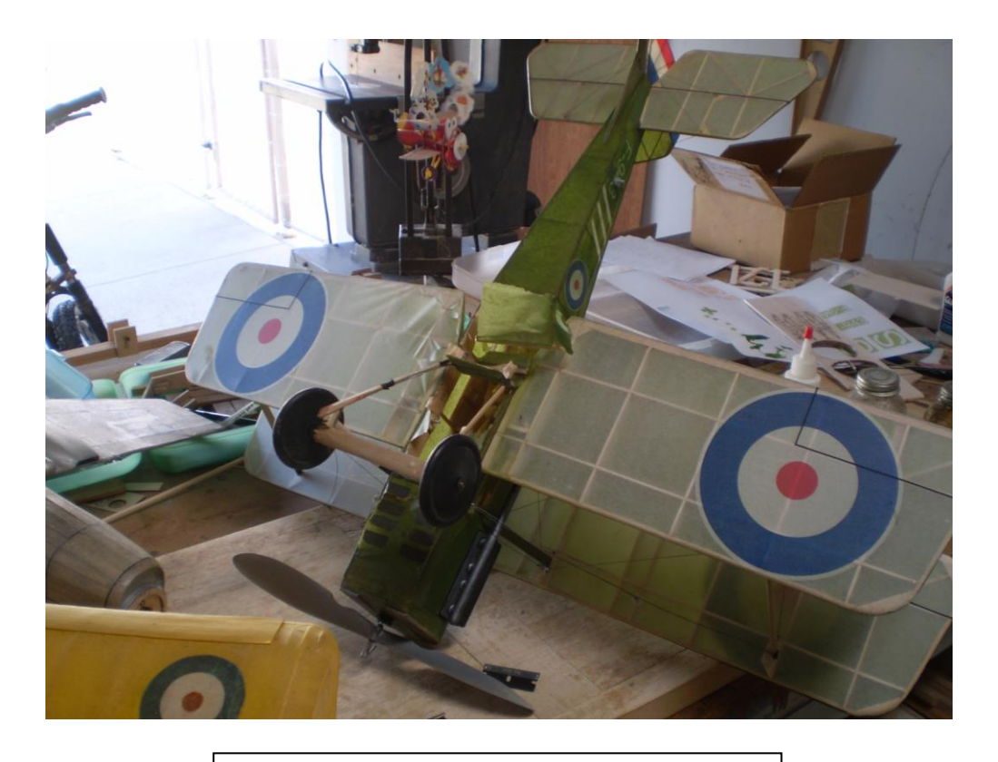
The Agony and Ecstasy of Free Flight!