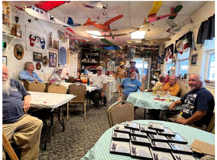
By the end of the contest, all were ready for the awards and the raffle!