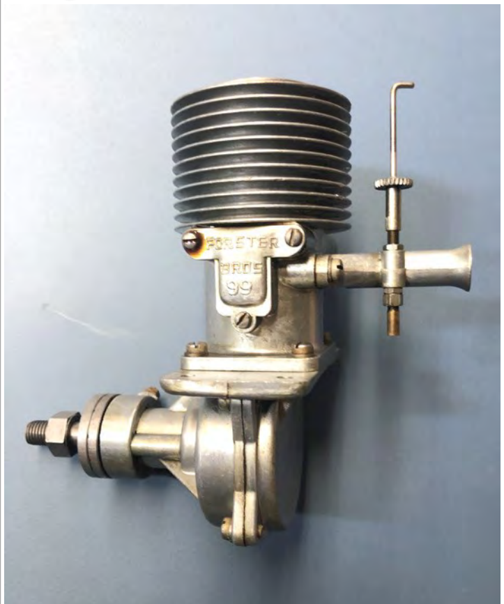
Forster 99 engine from Gary Leopold Collection.