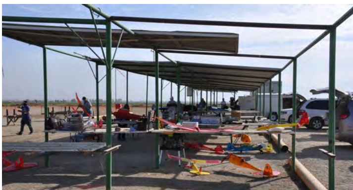
The pit area of the Greenfield Flyer RC Club.