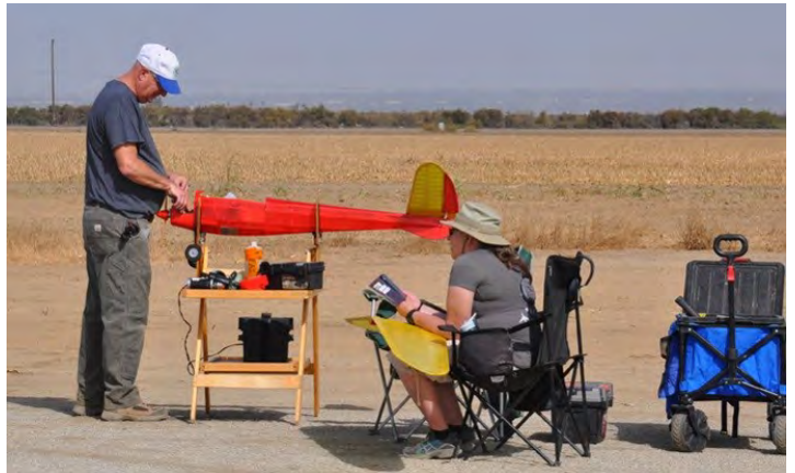
Team Warner and the V-Tail Swallow.