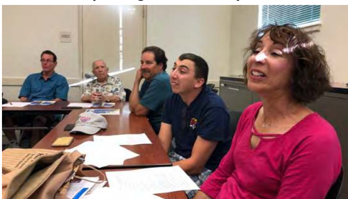
More guests at the end of the room.