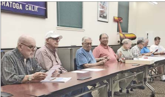
Left: The jury is still out...(cold)