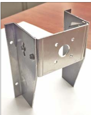
Far Left: Very nice motor mount from local source?