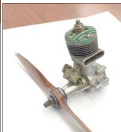
Left: Older Torpedo .15