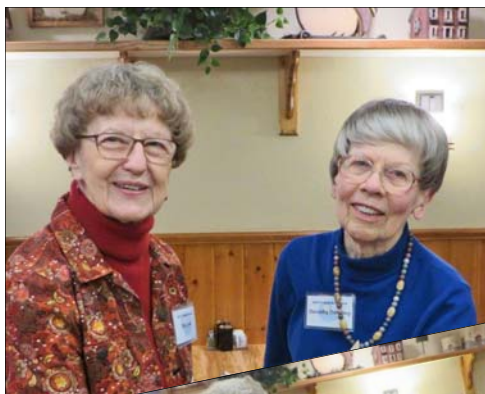
All pictures on pages 6 and 7, courtesy of expert photographer, Lescher Dowling...