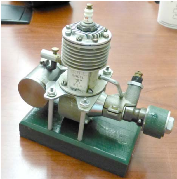
Above: Gary Leopold acquired this BRL Model 'A' engine at a swap meet. No additional information available. Looks run able?