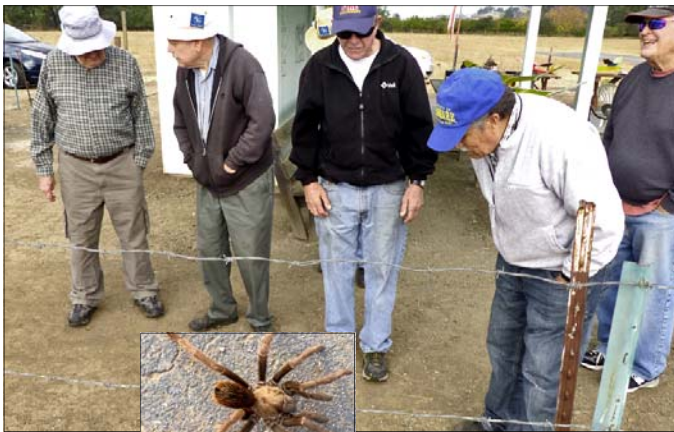
Left: Turns out the most exciting thing at the contest was the discovery of a good sized tarantula - like no one had seen one before???