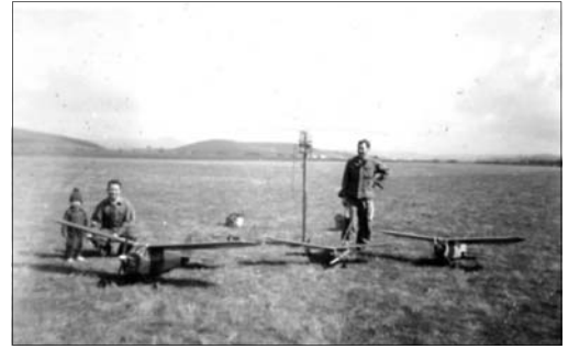
Right and Right below: Thought to be the first, or one of the first, radio controlled model in Livermore - note Xmtr and antenna with model, upper right, in the lower picture