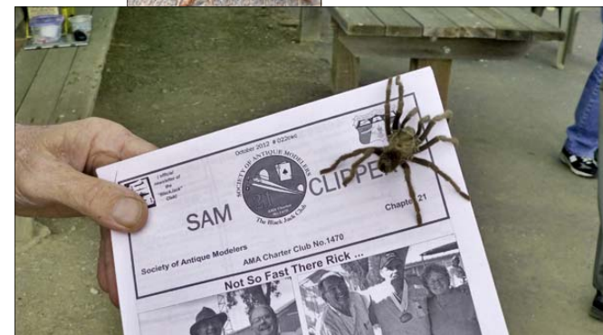
Above: Everyone reads the Clipper ... (our latest 'honorary' member)