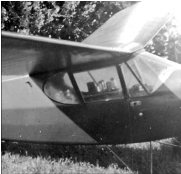
Left: Dr Poco's 'mystery ship' detailing the tube driven receiver