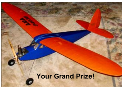
Your Grand Prize!

Participant Trophies! - Certificates! Other Prizes T.B.D.