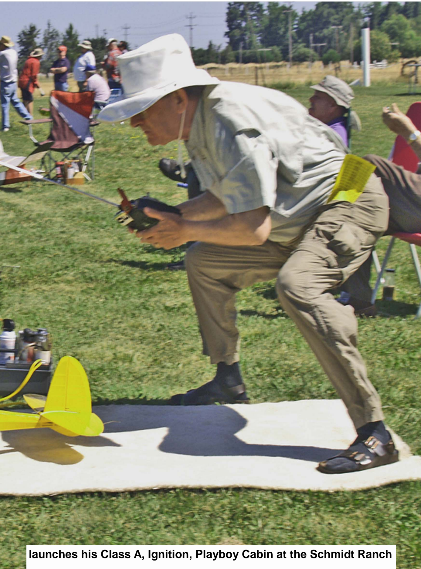
launches his Class A, Ignition, Playboy Cabin at the Schmidt Ranch