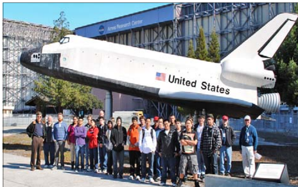
Above: Oceana High School students and advisors pause for a picture in front of the scale Space Shuttle, during their tour of the NASA Ames facility at Moffett field