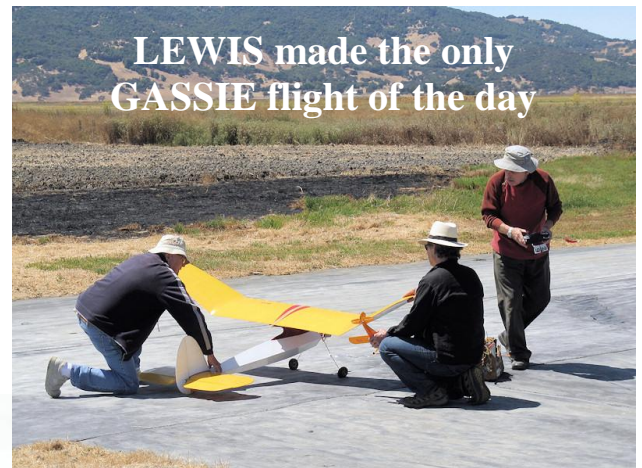
LEWIS made the only GASSIE flight of the day