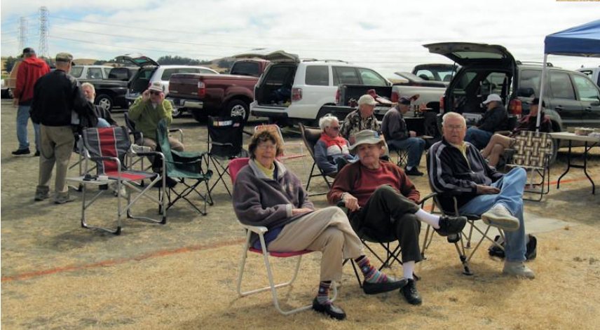
Most of the SAM 21 Contingent