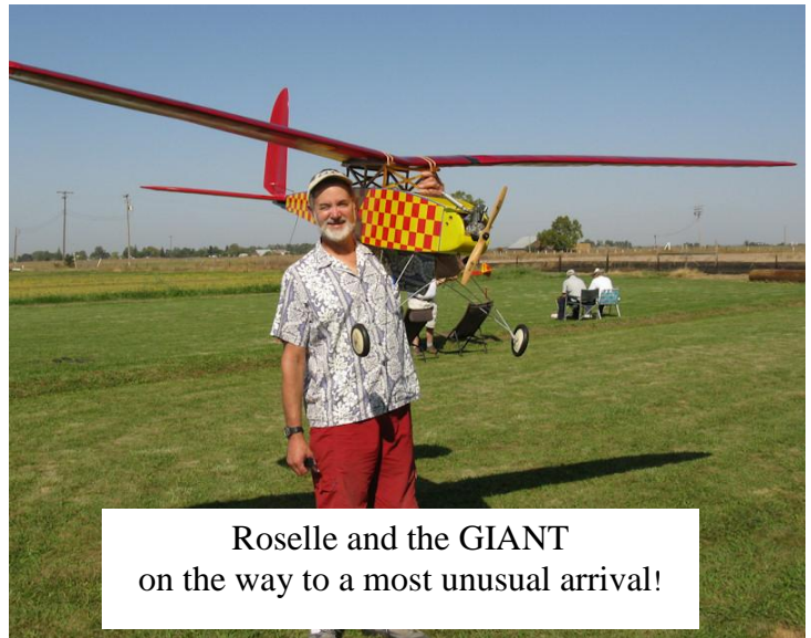
Roselle and the GIANT on the way to a most unusual arrival!

On the third flight I banged into a thermal and rolled the Giant up on its wing to center it. At that point something red blew off the back. It was the entire rudder! Within a few moments the Giant fell into a flat spin. After shutting the engine off, the rate of rotation increased dramatically with the visual effect of a pinwheel. Decent rate was very slow as only a 14 pound Boehle blimp can do while turning up maybe 15 to 20 RPM. What to do? Nothing actually.