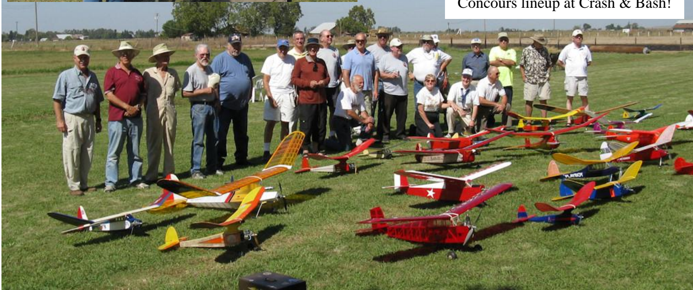
Concours lineup at Crash & Bash!