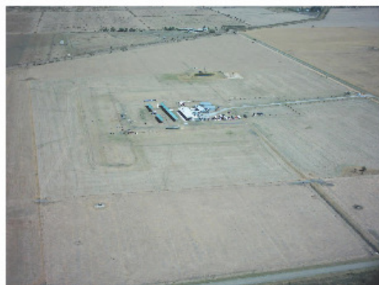
P&DARCS Roy Robertson Memorial Trophy 21-Jan-2009 from 3 min high.