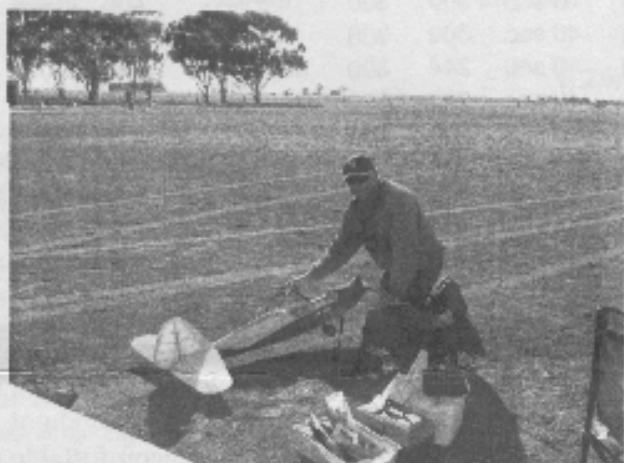
Photo Essay of the Annual Easter Fly-In held this year at Horsham. All these photos were taken on Easter Sunday, the only good day of the weekend