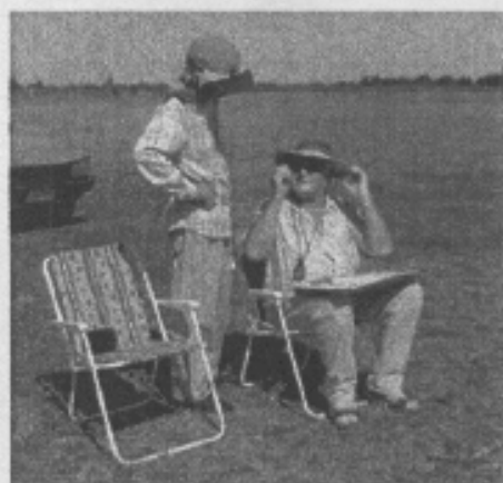
Just chatting to old friends, half the fun of Old Timer Contests