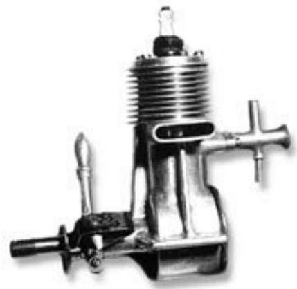
Reginald Denny “Sky Charger” engine above and shown below with one of his models in his beloved Hobby Shop.

Jane Withers holding one of the beautifully built Dennyplanes that appeared in the movie Holy Terror . Jackie Cooper was another young star who received one of the six-foot models as a gift from Reginald Denny.