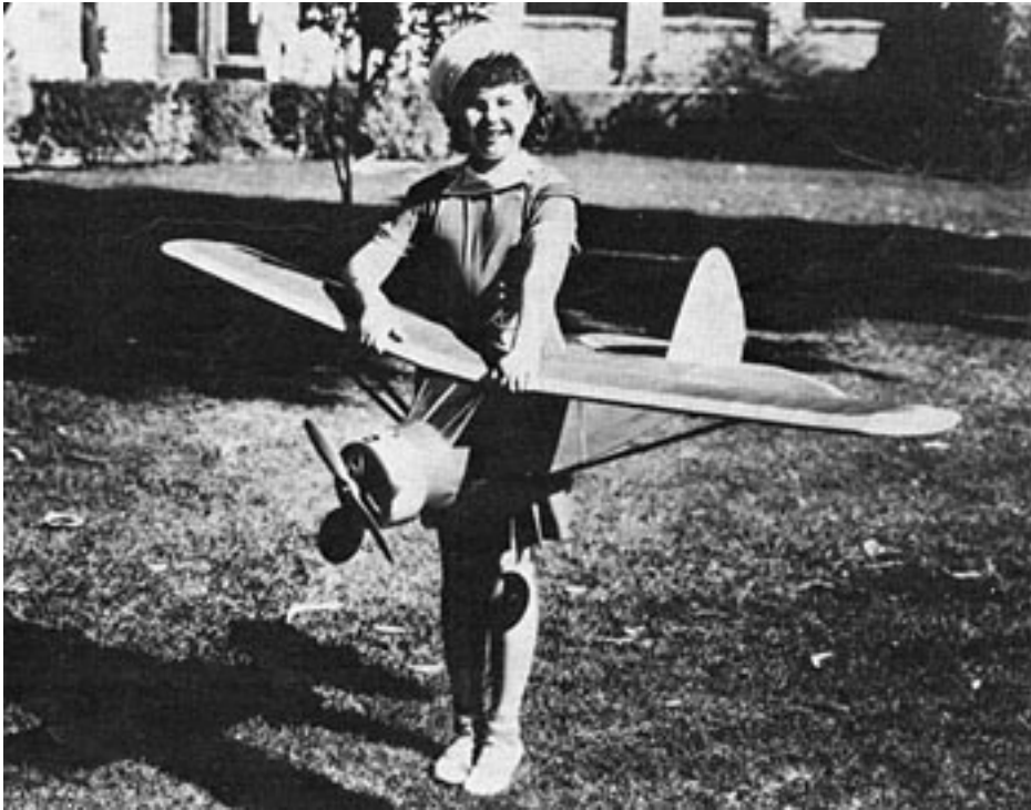
Jane Withers with her ‘Dennyplane’