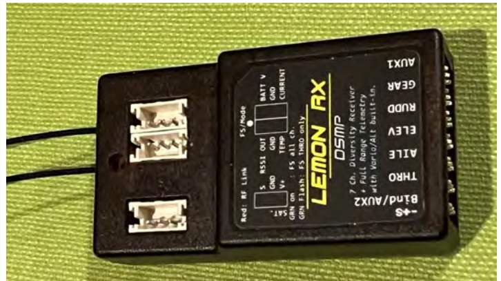
Sam showed a Lemon RX (LM0052) 7 Ch DSMX, it has telemetry to relate the altitude information to be displayed on the tx.