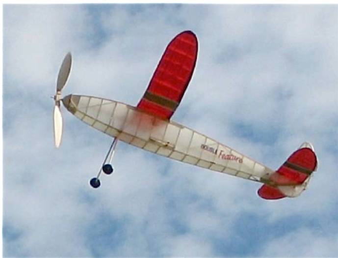
Al Pardue's Double Feature Placed Fifth