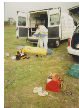
The new Gas Champ