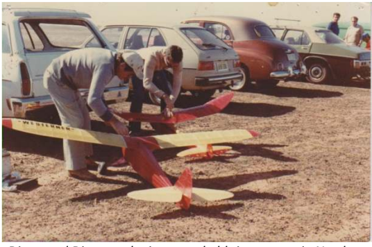
Dixon and Dixon at the inaugural old timer meet in Northam. Westerner and Gas Champ.