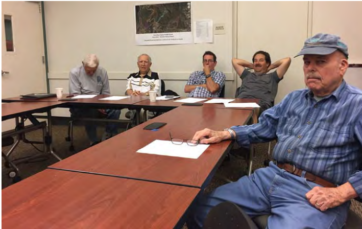
See no evil, Speak no evil and Hear no evil!